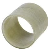
Piesă de trecere SL GRP